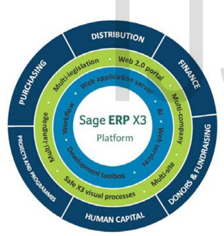
Fig. Sage ERP X3 Platform

Sage ERP X3 is comparatively quicker to implement cost effective and easy to use. It integrates business processes into one common system. As business grows, Sage ERP X3 adapts to changing needs, enabling optimization of operations. It provides a chance of flexible services.